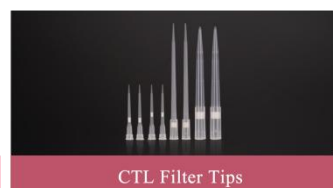
CTL Filter Tips