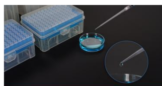
Low Retention Pipette Tips