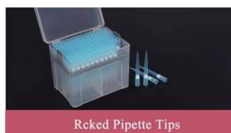
Racked Pipette Tips