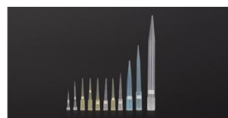
Universal Aerosol filter Tips